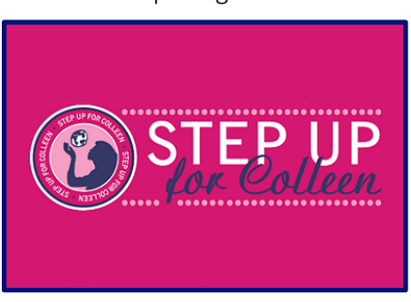
The 2019 Step Up for Colleen 5K Walk/Run