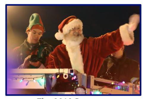
The 2019 Danvers Holiday Festival